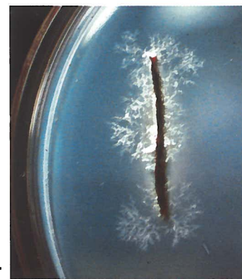
1) Typical areas of Phytophthora damage 2) Early stages of symptoms expressed in August 3) Root symptoms of a diseased (left) and healthy plant (right) 4) P. cinnamomi growing out of a diseased root on culture medium.

Control of the disease can be achieved only through implementation of several integrated strategies. It is essential that drainage be improved in these low areas of the bed. Drain tile, crushed stones or other materials can be utilized to improve drainage. New lateral ditches can be dug and already existing ditches should be maintained to the proper depth. Areas of dieback should receive enough sand to get the areas up to grade with the remainder of the bed. Stressed plants on the margin of dieback areas should be given an extra dose of fertilizer to stimulate root growth. Vapam or Basamid can be used to renovate particular sections if necessary. It is important to realize that once renovated beds are flooded, the fungus may be re-introduced.