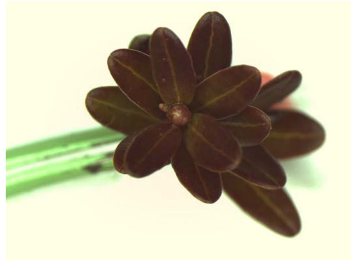
Mullica Queen 22°F