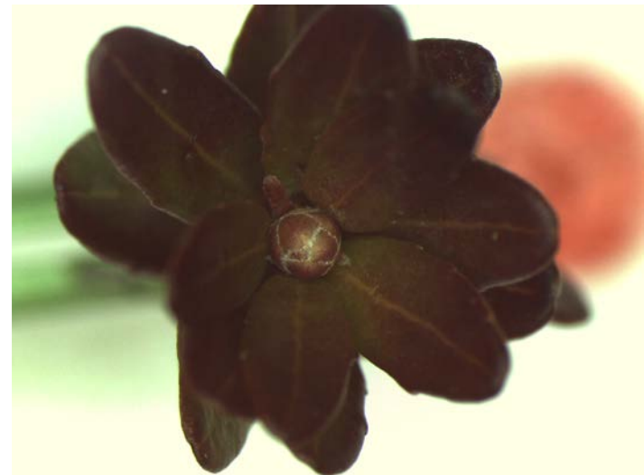
Mullica Queen 22°F