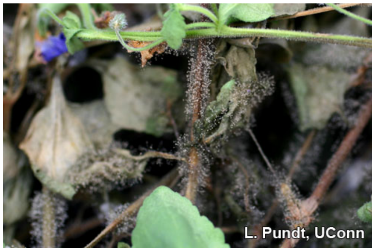
Stem canker on Bacopa caused by Botrytis (fuzzy spores)

Botrytis symptoms may include leaf spots, flower blights, bud rots, stem cankers, and stem and crown rots. When conditions of high relative humidity persist in the greenhouse there is fungal sporulation on dead tissues that appears as fuzzy grey mold. Botrytis leaf spots appear when infected flower petals fall on the leaves. Infection starts as small water spots which coalesce into larger gray brown spots. If leaves have marginal or tip burns, Botrytis may invade the damaged tissue and leaves develop triangular shaped gray brown lesions. On flowers, Botrytis appears as tannish irregular spots on flower petals which eventually enlarge into larger areas. If flowers are infected in bud stage, the buds turn brown and appear water soaked. The buds fail to open and may abort. If the fungus infects the flower or leaf at the base of attachment to the stem, the disease can spread into the stem causing stem cankers.