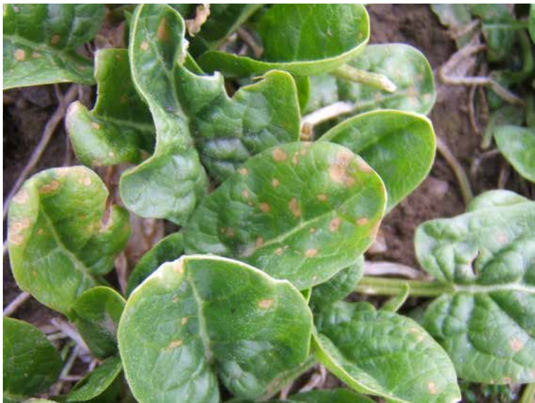
Cladosporium leaf spot of spinach has been confirmed in a few locations in Western MA. The small, light, discrete spots may develop chocolatey-brown, velvety sporulation under moist conditions.

sure to replace the row cover to prevent windburn on those tender leaves! Caterpillar tunnels are coming down or transitioning to spring crops. The first greenhouse crops are going in: cucumbers, tomatoes, peppers. Farmers are definitely getting a late start this year with some growers just making it into their field this week for the first time to plant peas, carrots or lettuce and removing the mulch from strawberries. Fertilizing and sub-soiling has begun in lighter soils for planting potatoes. One farmer pushed back his entire planting schedule by 10 days this year. Soil temperatures and growing degree days are a good indicator of our delayed spring as compared to last year. Soil temperatures at the UMass Agronomy and Vegetable Research Farm in South Deerfield are hovering around 45°F at 3in. and 44°F at 8in. in bare ground whereas last year on April 20 th the same field was, 52°F at 3in. and 48°F at 8in. If you have delayed your plantings