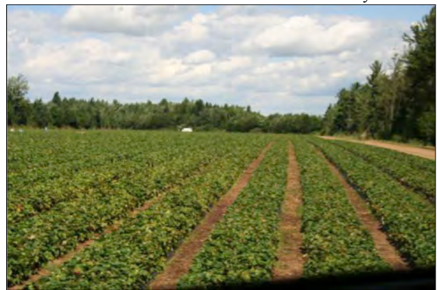
Day neutral strawberry field under harvest, August 2010