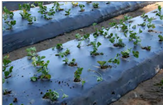
Newly planted plug plants, August 2010

80 lbs of actual N/A for the season to 15# N/A every week! When asked about their nutrient management plan, Isabelle Charbonneau said the farm constantly monitors