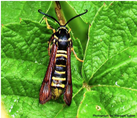
Fig 1: Raspberry crown borer adult on raspberry leaf measuring about 25mm in length

The raspberry crown borer is a clearwing moth, similar in appearance to a yellow jacket wasp. It measures approximately 25mm in length and has a wingspan of about 30mm. The adult can be seen basking on raspberry foliage during the day (Figure 1).