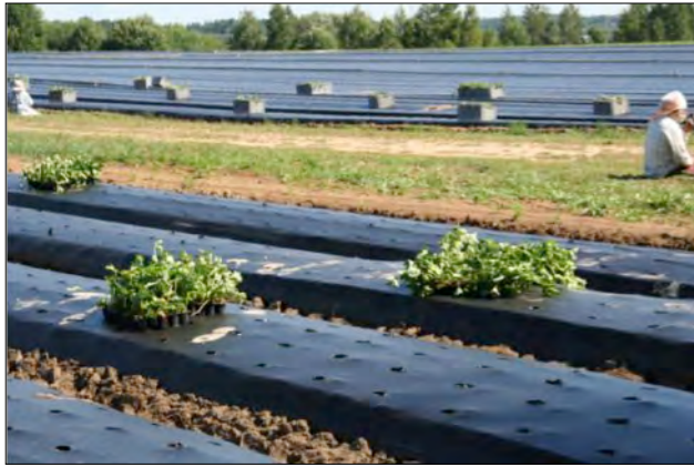
Trays of plug plants laid out ready for planting

strawberries plus over 22 acres of field and high tunnel fall raspberries. They supply fresh berries to wholesale and retail markets throughout Quebec from June through October.