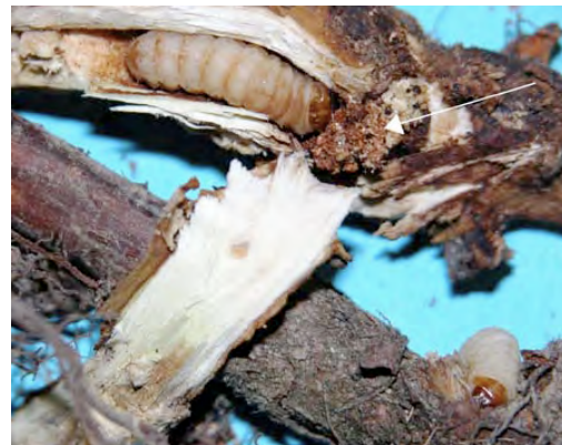
Fig 3. Raspberry crown borer larvae tunnelling into crown tissue. The arrow points at frass associated with larval feeding.

Damage from this pest can often go unnoticed for some time. Symptoms are sometimes confused with winter injury, or Phytophthora root rot. To diagnose the problem accurately, use a spade to dig up crowns of weak plants. Shake away the soil and examine the crown for reddish-brown frass and tunnels. Use hand-pruners to cut the crowns carefully to look for crown borer larvae in and around the damaged area (Figure 3). In late fall and early spring, tug on affected canes. If crown borer is the culprit, the affected cane will usually break off at the base, revealing larvae and frass below.