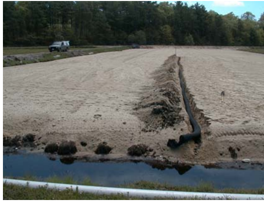
Installation of a drainage pipe on a newly prepared farm surface

Proper soil drainage improves fertilizer efficiency so that less fertilizer is required. Check soil moisture at least twice a week; soil should be moist but not saturated in the top 6 inches. The use of water-level floats, sensors, and/or tensiometers is highly recommended.