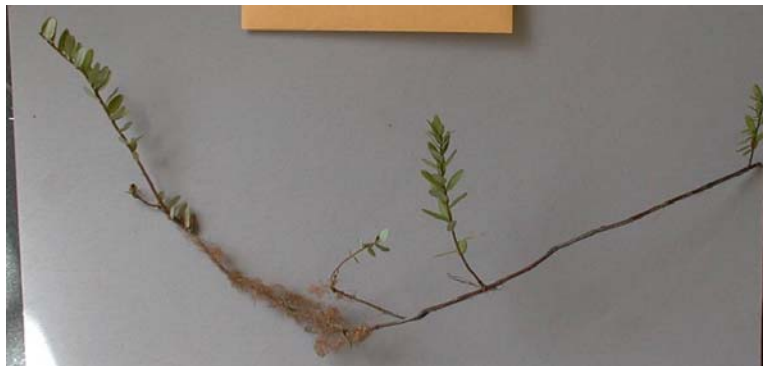
Cranberry runners, uprights and fine fibrous roots

Commercially, cranberries are grown in either organic soils modified by surface application of sand, or in mineral soils. On most Massachusetts cranberry bogs, the rooting zone typically contains about 95% sand -- the average organic matter in the surface horizon is less than 3.5% and silt and clay make up less than 3% of the soil. Therefore, the root zone of a cranberry bog has low cation exchange capacity: little ability to hold positively charged nutrients such as ammonium, potassium, magnesium, and calcium. This can present horticultural and environmental challenges. On the horticultural side, it is important to retain nutrients in the root zone where they can be taken up by the plants. On the environmental side, the layered structure of cranberry soils attenuates the downward leaching of nutrients. Layers of sand are added to the bogs every 2-5 years leading to alternating sandy and organic layers. The organic layers, comprised of decaying roots and leaves, have the capacity to hold nutrients. Leaching is further minimized if the subsoil is highly organic, as in a peat-based bog. These characteristics protect the ground water, but growers must still guard against movement of nutrients into surface water.