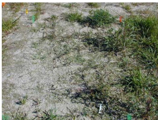
Vines colonizing open ground on a cranberry farm

If you plant rooted cuttings, applications may begin immediately. However, be aware that plug plants may experience transplant shock and appear dormant for up to 3 weeks after planting. With this in mind, applications other than slow release materials may be most effective if applied 2-3 weeks post-planting.