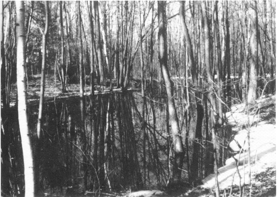
Figure 5. Breeding pond for spotted salamanders and wood frogs.

through. Salamanders that did not go through generally hesitated before the entrance and then turned back. Even among those animals that passed through, several hesitated at the entrance, sometimes turning away and returning several times before going through. Several possible explanations exist for this 'tunnel hesitation', including differences in temperature, humidity or light, air flow or human disturbance.