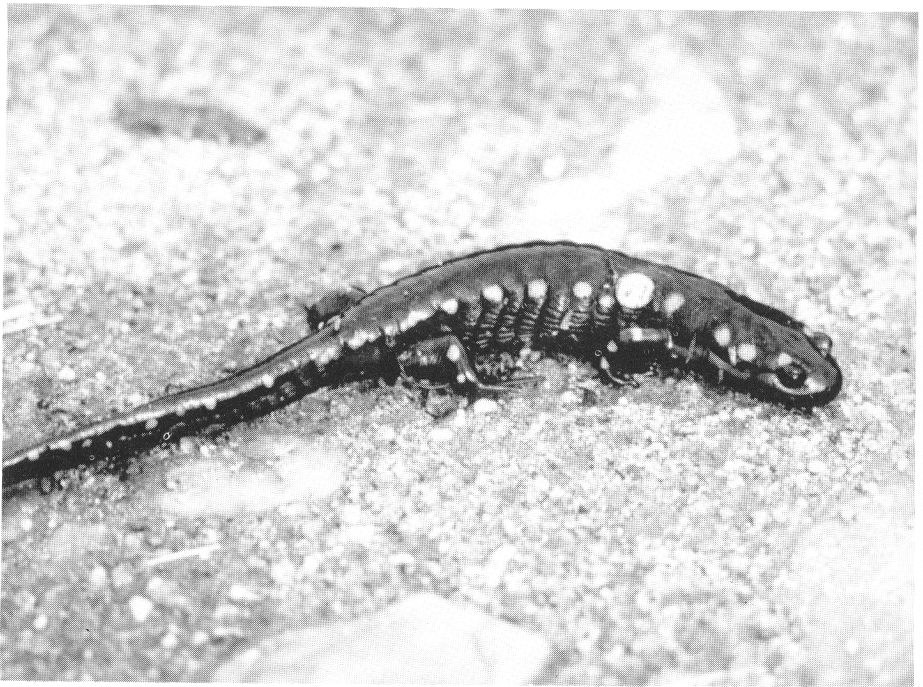
Figure 4. Salamander marked with numbered paper dot.