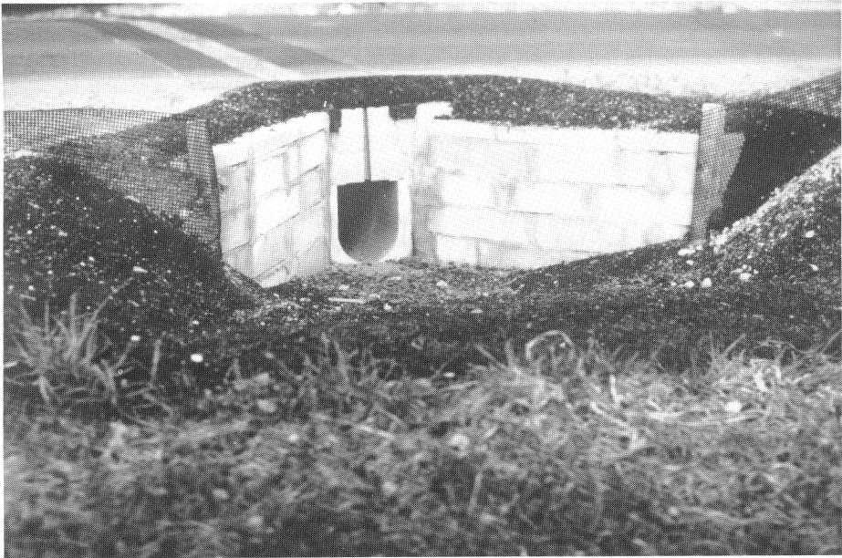
Figure 2. Tunnel entrance at Henry Street.