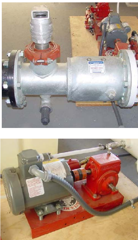
Fig. 2. (Top) Irrigation line check valve, vacuum relief valve, and low pressure drain. (Bottom) Pesticide metering pump. Diagram and photos courtesy http://www.cdpr.ca.gov/docs/emon/grndwtr/chem/chemdevices.htm .

properly and that people have not inadvertently wandered into the application area. If the injection site is remote from the application area, consider stationing another person or vehicle near the application area.