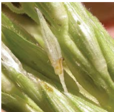
Tiny ECB caterpillars feed inside the florets of the tassel. Look for the black head capsule, brownish damage and frass (excrement).