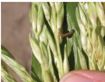
As they grow, caterpillars move around to feed in the florets or the stalk. Because caterpillars are moving on the surface, this is a good time for spray applications. Target controls from pre-tassel to open green tassel stage, before ears form and ECB caterpillars tunnel into stalks and ears.