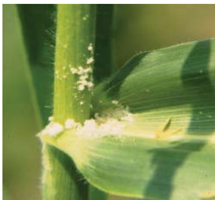
As caterpillars move down the stalk, they settle just above the leaf nodes (above) or tunnel into the side of the ear (right). A caterpillar feeding in the stalk produces white or light tan sawdust-like frass.