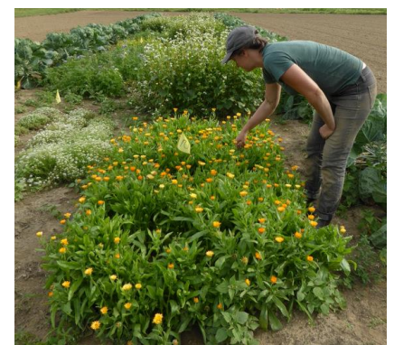
Sue counting syrphid flies in her insectary study for managing cabbage aphids in Brussels Sprouts.