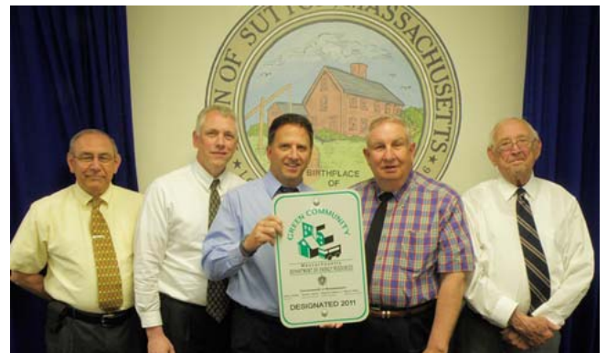
Sutton's Board of Selectmen displays Green Communities sign