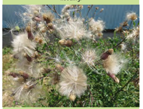
Canada thistle seeds are easily blown by wind.