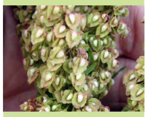
Curly dock seek have 'pontoons' that float in water.