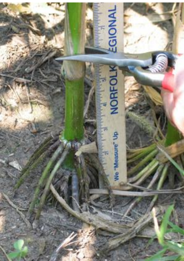
Figure 2. Samples should be taken 6 inches from the soil.

Dairy One Forage Lab 730 Warren Rd. Ithaca, NY 14850 Ph: 1-800-496-3344 Fax: 607 257-1350 Call ahead to ensure analysis.