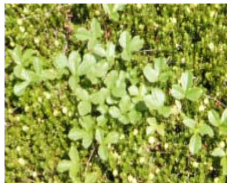
Heavy infestation of bristly dewberry on a commercial cranberry bog.

The most effective way to manage dewberries is to eliminate them as they invade the bog. Remove young plants by pulling or digging out roots. Chemical control with glyphosate wipes is difficult because the weeds grow so intimately amongst the vines. However, wiping does stall