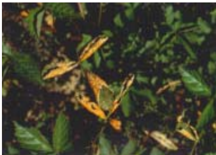
Rust fungus infecting upright bramble.

Brambles and dewberries have upright and arching to trailing stems (3-4 m) arising from root buds (Uva et al., 1997). Brambles spread by seed, root sprouts, rhizomes, and stems that arch to the ground and generate roots at the tips. Dewberries spread rapidly on cranberry bogs by rooting at the tips of their canes. Dewberries will form a dense thicket and kill vines if left unmanaged. Stems (or runners) have been known to grow to lengths over 15 feet. All brambles and dewberries have roots that are woody and tough.