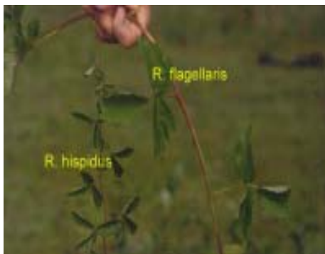
Comparison of R. hispidus (bristly dewberry) and R. flagellaris (prickly dewberry) stems and leaves. Note the heavier stem and wider leaf placement of the prickly dewberry.

Vegetative growth continues until cold weather predominates. Flower bud initiation occurs in the late fall, followed by flower development the next summer on the floricanes (Pritts and Handley, 1989).