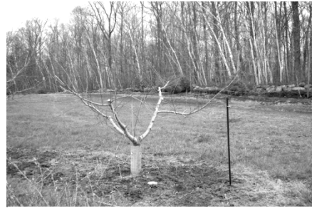
Figure 7. Peach tree trained to an open center (vase) form.

the shoots that were produced in the previous season, it is important to obtain good growth each year for the following years fruiting. Peach trees are very vigorous and have the capacity to grow a great deal each year. Because of the nature of the tree and the way fruit are produced, peaches are best grown to an open center (or vase) form (see Figure 7). Trees should have 3 to 5 main scaffold branches originating from a trunk, 2-3 feet from the soil surface. This structure should be developed by pruning in the first few seasons after planting.