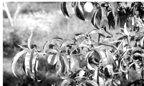
Figure 9. Thinning peach fruitlets is required for a crop of large, high-quality fruit.

Peach trees often are short-lived, but if they are pruned properly in dry conditions and thinned well each year, they should be able to produce fruit for 10 to 15 years before they need to be replaced.