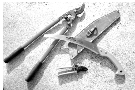
Figure 1. Basic tree-fruit pruning tools.

Tools. Pruning of fruit trees requires three primary tools (see Figure 1). Bypass hand pruners are a necessity. Good quality pruners, such as Felco or Pica, should cost between $35 and $60. You also should have a pair of bypass loppers (24-26”) with a nicely curved hook on the blade. Barnell, Corona, and Bahco produce loppers in this category cost between $45 and $100. The last tool is a good saw. Our favorite is a 13” curved blade pruning saw with a Japanese-style blade (Tri-cut, Tiger Tooth, Turbo Cut, etc.). This is a pull saw with a very sharp blade and costs between $20 and $30. It is best also to purchase a sheath or scabbard for the saw to both protect the blade and you from the blade ($20 to $30).