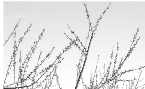
Figure 8. High quality shoots on peach trees.

Peach trees often are short-lived, but if they are pruned properly in dry conditions and thinned well each year, they should be able to produce fruit for 10 to 15 years before they need to be replaced.