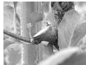
Figure 6. Renewal or bevel cut with increase the chances of a new usable shoot being produced.