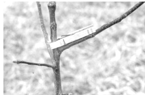
Figure 3. Wooden clothespin used to maintain a wide angle between the branch and the trunk (at the end of the season).

easily set with a clothespin clamped onto the trunk above the shoot (see Figure 3).