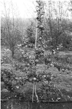
Figure 2. Conical shape of a central-leader apple tree.

As noted above, apple trees flower and fruit on spurs borne on 2-year-old and older wood. The greatest number and highest quality fruit are produced on wood that is between 3- and 4-years old. Pruning and training efforts are focused on maximizing the amount of fruitful wood in a tree and providing the conditions where this wood can produce fruit of high eating quality. Much research and experience has shown that the easiest tree form with which to attain these goals is a central leader, a tree with a single trunk and generally a conical shape (see Figure 2). We will detail a few of the approaches necessary to obtain and maintain the ideal tree.