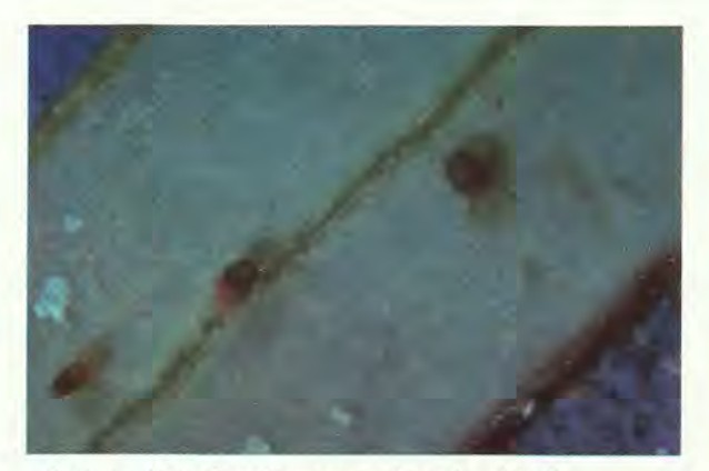
Active mite infestation on underside of leaf

From mid-September to the beginning of October, a harvest flood or trash flow may reduce the number of motile mites and, therefore, the number of overwintering eggs.