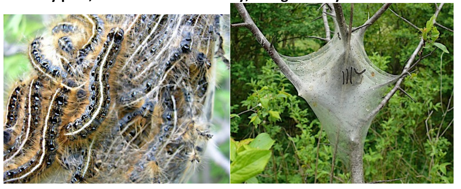
Figure 1. Eastern tent caterpillars are clearly identified by the white stripe running down the back and the presence of white silken tents in trees in early spring. The caterpillars are hairy with areas of blue, white, black, and orange.

NOT a cranberry pest, does not eat cranberry, and generally not found on the bog