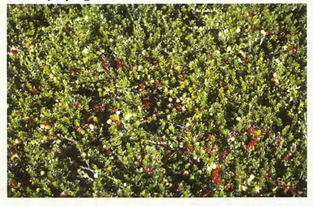
Dead uprights can be seen scattered among the healthy uprights.