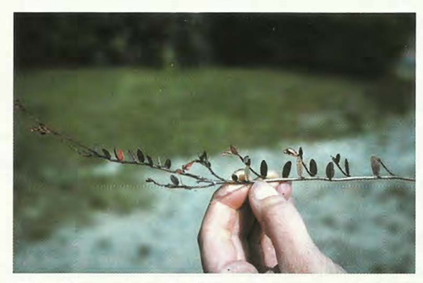
The disease spreads from the new growth down the runner and every upright may be affected on the runner.