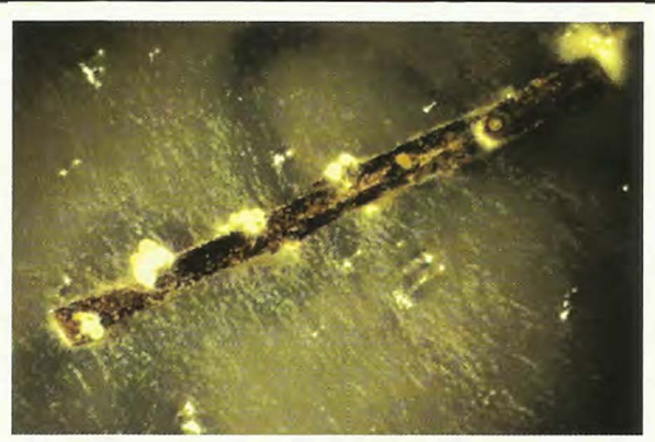
Phomopsis growing on a upright segment in the lab on culture medium.