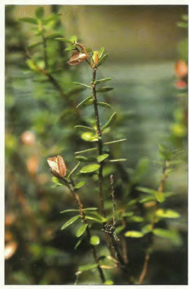
Upright dieback kills the new growth first.

If you think your bog may have upright dieback, bring in at least 50 uprights showing the symptoms. Keep samples from different cultivars separate. The uprights will be cultured to identify the possible pathogen fungi. If these fungi are not isolated, then fairy ring or drought stress may be implicated as the cause of the dieback.