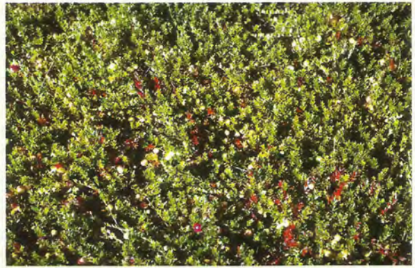
Dead uprights can be seen scattered among the healthy uprights.

Upright dieback clearly seen on a new planting.