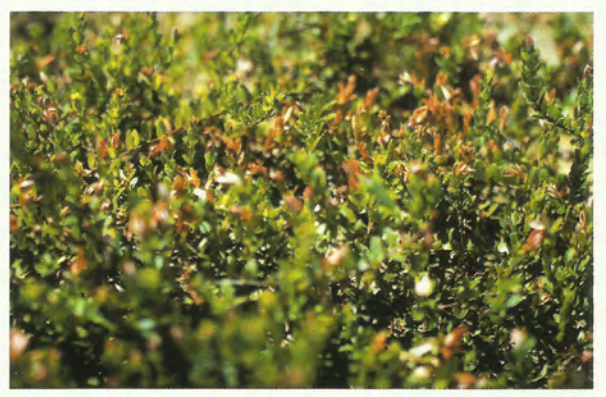
Scattered uprights affected by the disease.