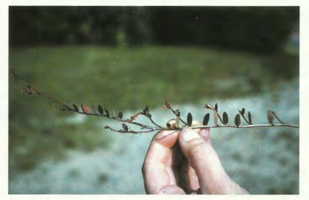
The disease spreads from the new growth down the runner and every upright may be affected on the runner.