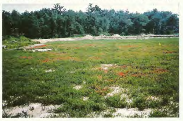
UMASS AMHERST - CRANBERRY EXPERIMENT STATION

Upright dieback clearly seen on a new planting.