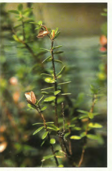
Upright dieback kills the new growth first.

If you think your bog may have upright dieback, bring in at least 50 uprights showing the symptoms. Keep samples from different cultivars separate. The uprights will be cultured to identify the possible pathogen fungi. If these fungi are not isolated, then fairy ring or drought stress may be implicated as the cause of the dieback.