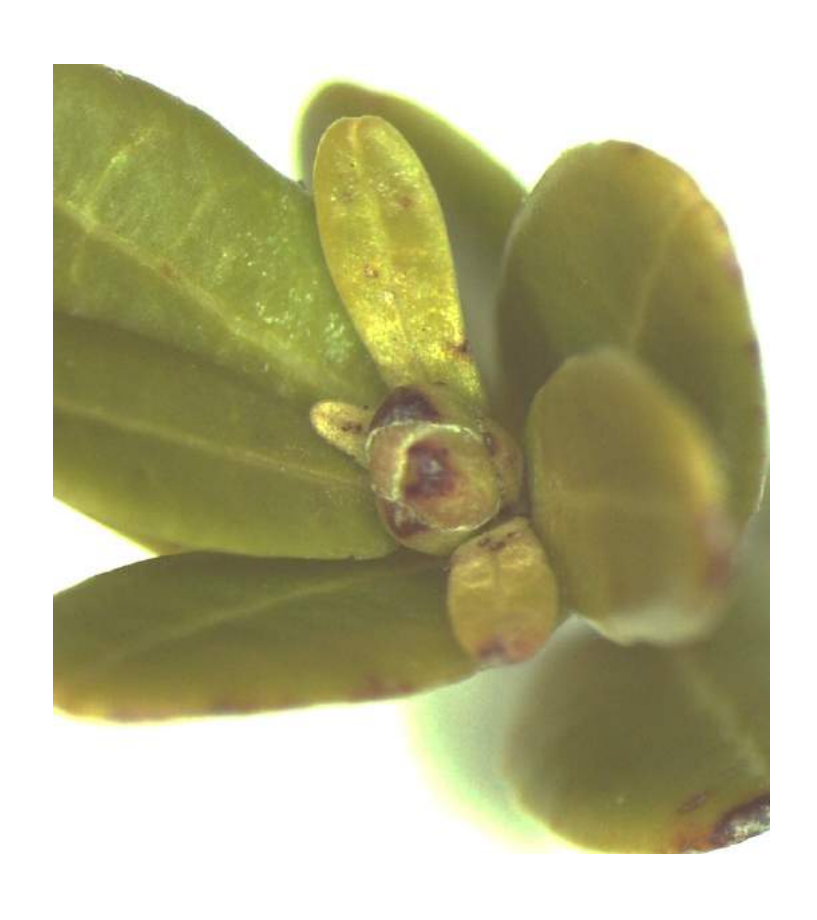
Ben Lear, Rosebrook 5.10.22 Elongation stage, tolerance 29.5°F