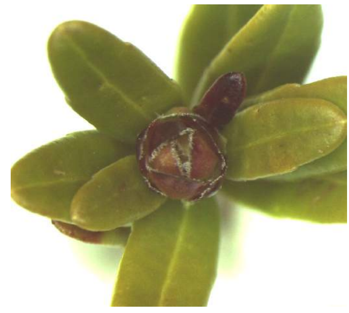
Early Black 29.5° F (due to 6 days since 27°F)

Howes 29.5° F (due to 6 days since 27°F)