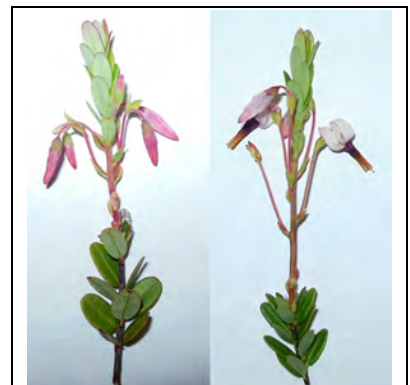
Hook Stage (L), Bloom (R) 29.5°F