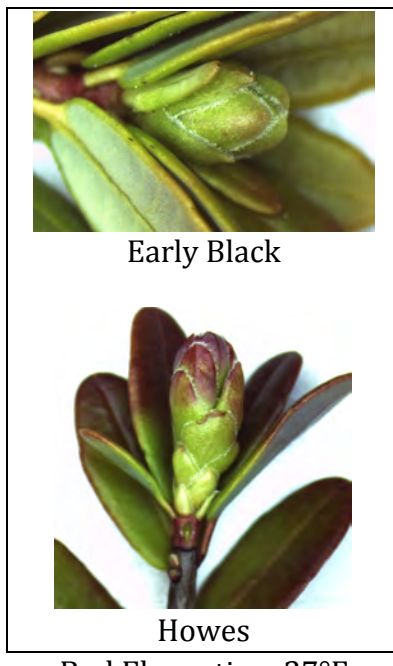
Bud Elongation 27°F