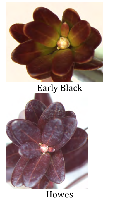
White Bud Stage 20°F