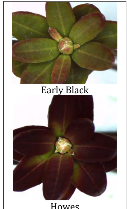
Bud Swell Stage 22°F