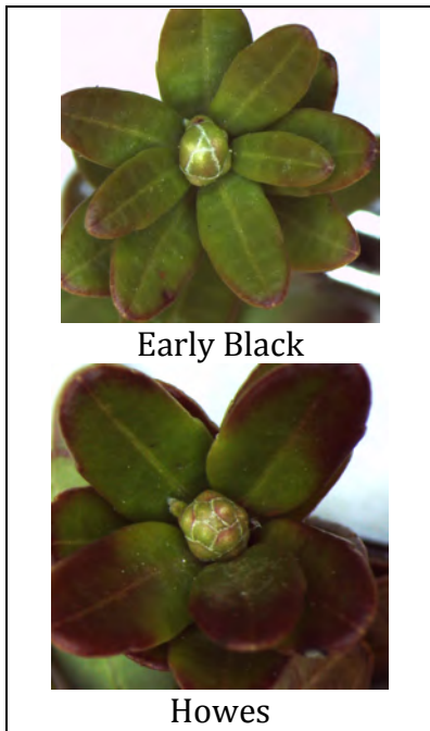
Cabbage Head Stage 25°F