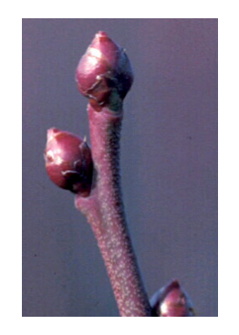
Dormant Description: No visible swelling of the fruit buds. Bud scales tightly closed. No visible signs of growth.

Image and Description Source: <u>Michigan State University Blueberry Facts</u> website.