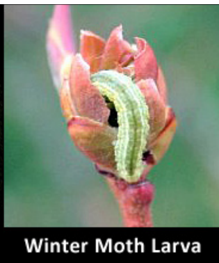
Winter Moth Larva