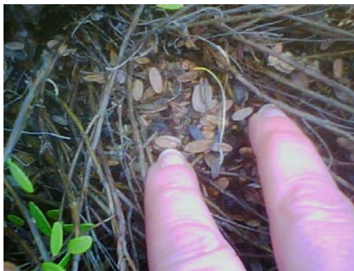
Newly emerged seedling between fingers

Scouting. Scout in areas where infestations have occurred and in bare areas previously infested. Newly emerged seedlings are usually yellow in color, very slender, and 0.5 to 3 inches long. If the vine cover is good, move the vines aside so that you can see the duff layer; this is where early emerging seedlings will be seen.