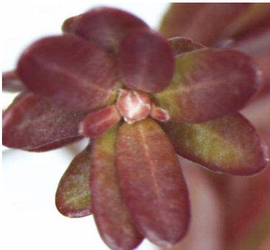
EB bud from Rosebrook Bog, April 14. Spring dormant stage, tolerance 18°F.