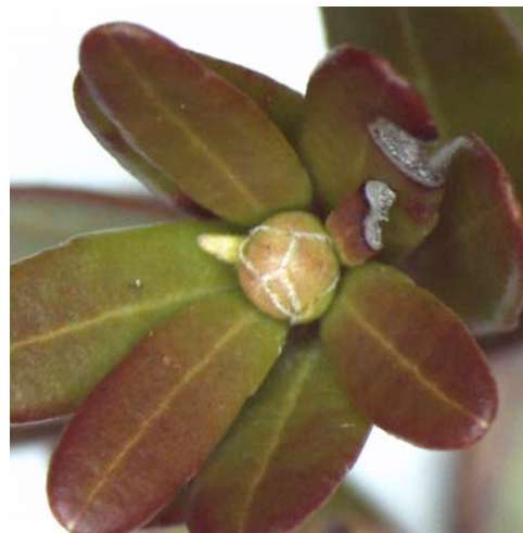
EB bud from Rosebrook Bog, April 22. White bud stage, tolerance 20°F.