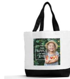
Tote with Club Name

More information is on the website along with ideas for community service: