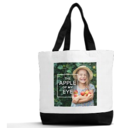
Tote with Club Name

More information is on the website along with ideas for community service: https://ag.umass.edu/mass4h/clubs-programs/community-service