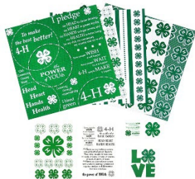
Scrapbook Kit & Cards