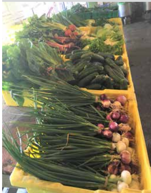
Cornucopia in Berkshire Co., MA.

Onion thrips pressure remains high and damage is severe in untreated fields across the region. Thrips feeding causes whitish flecks, curling, and bending of the leaves that can reduce plant vigor and bulb size. Wounds produced by their feeding provide entry points for bacteria, which can later cause bulbs to rot in storage. There are many effective insecticides, both organic and conventional, that can be used to control thrips populations. Find them listed here: http://nevegetable.org/crops/insect-control-14 . Include a spreader/sticker to help the spray stick to waxy allium leaves.