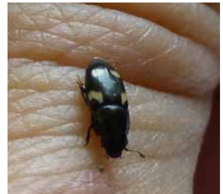
Four-spotted sap beetle adult.