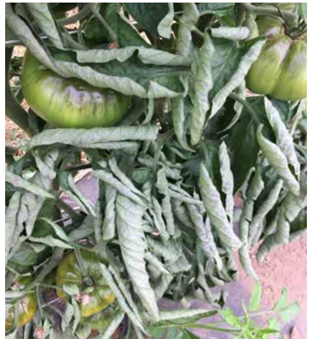
Leaf curl.

Leaf roll is often seen just after plants are heavily pruned during dry soil conditions, but oddly enough, leaf roll disorder also has been found to be caused by excess soil moisture coupled with extended high temperatures. If the tomato plant’s top growth is more vigorous than root growth and we are hit with a dry hot period, the foliage may transpire water faster than the root system can absorb it from the soil. In order to conserve water, the plant will roll up its leaves to reduce the surface area from which water can evaporate. Leaf rolling can also result from growing high-yielding cultivars under high nitrogen fertility programs. Cultivars selected for high yield or early ripening tend to be the most susceptible and indeterminate varieties are more sensitive than determinant. The good news is that leaf roll rarely affects plant growth, fruit yield, or fruit quality. Some viruses can look similar to tomato leaf roll, but if the symptoms appear suddenly, involve many of the plants in a field, and largely affects lower leaves, it is probably just physiological leaf roll. Management: Reduce symptoms by maintaining consistent, adequate soil moisture (~1 inch per week during the growing season, which will also help with calcium up-take, reducing blossom end rot problems). Do not prune heavily during hot, dry conditions or over-fertilize with nitrogen.