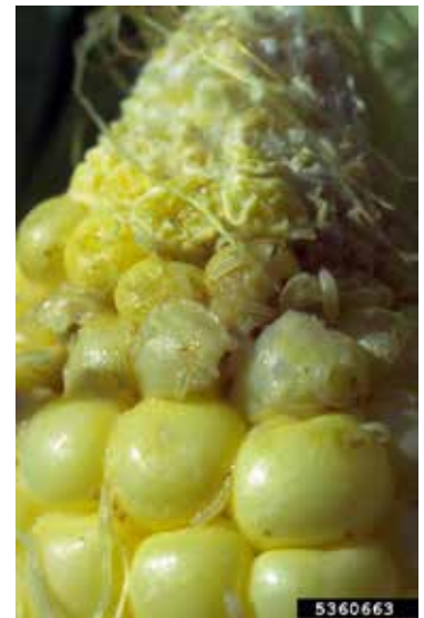
Sap beetle larvae and damage.

Cultural practices. Ears with exposed tips, especially super sweet and Bt varieties, are especially susceptible to infestation. To prevent or reduce damage, select varieties that have good tip cover, use clean cultivation, and control ear-infesting caterpillars. Sanitation is important to prevent successful overwintering and reproduction during the season. Bury corn residue, especially decomposing ears; remove or bury alternate hosts such as rotting tree fruit or discarded vegetables on a regular basis but especially in the fall to reduce the size of the overwintering population. Burial should be deeper than 10 cm.