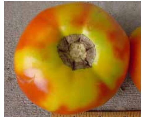
Yellow shoulder.