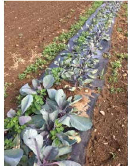
Cabbage plants stunted from flea beetle damage show where row cover ended. Photo: S. Scheufele

Tomato hornworm caterpillars were found this week in tomato crops across MA and also in pepper in RI. Scout by searching leaves for damage, frass, or larvae. Often one sees defoliated stalks or the characteristic dark-green fecal droppings (frass) before the caterpillar is located. There is no set economic threshold for this pest in tomato. Where damage is unacceptable, or if there are high numbers, foliar sprays can be used. Use a selective material that will conserve beneficial insects, because those predators and parasites are very likely keeping your aphid populations under control. Insecticides include Bacillus thuringiensis (Bt) kurstaki or aizawi strain (Dipel DF, Agree, or Xentari, etc.), indoxycarb (Avaunt), tebufenozide (Confirm 2F), or spinosad (SpinTor 2SC or Entrust). Several synthetic pyrethroids are also labeled (note: these could result in aphid outbreaks). Although Bt usually works best on small larvae, in this