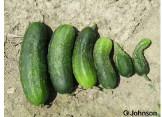
Progression from marketable to unmarketable pickle fruits that are crooked, waist pinched, tip pinched or tip pinched with crook.

Sap beetles have generally been thought of as secondary pests of sweet corn, usually associated with damage caused by caterpillars, but on some farms they are a regular and troublesome pest in early sweet corn plantings – even where caterpillars have been non-existent! Early sweet corn varieties tend to have poor tip cover, allowing sap beetle adults to lay