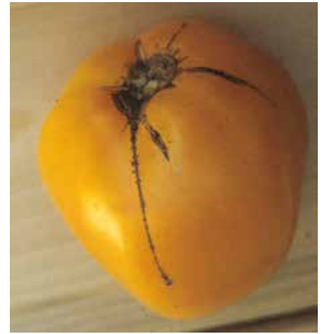
Stitching or zippering

Stitching/Zippering is the term for when a thin, brown, necrotic scar extends from the stem scar to the blossom end on fruit. The longitudinal scar has small transverse scars along it, making it resemble a zipper or seam. Fruit can have one or several scars. This disorder does not affect the edibility of the fruit, but may render fruit unmarketable. Zippering is caused by anthers (the pollen-producing flower part) fusing to the ovary wall of newly forming fruit. This disorder occurs more frequently in cool weather. Management: Plant varieties that are less susceptible to stitching/zippering. Avoid low greenhouse temperatures.