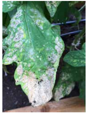
Extensive flea beetle damage on high tunnel tomatoes.

Flea beetles (FB) are continuing to cause severe damage to eggplant and tomato this year. This week we saw severe damage in a greenhouse tunnel tomato crop. Full size plants rarely require treatment for flea beetles. Most insecticides registered to control CPB, including spinosad, will control FB. The grower with the greenhouse outbreak will use yellow sticky cards placed in the canopy to try to trap out as many beetles as possible and reduce damage that way.