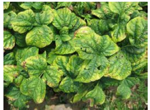
Hopperburn in bean