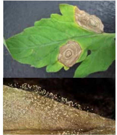
Botrytis leaf spots (above) and characteristic sporulation (below).

Botrytis Gray Mold & Ghost Spot ( Botrytis cinerea ): Botrytis cinerea causes leaf spots, stem cankers, fruit rot, and ghost spot on fruit. The pathogen thrives in the greenhouse where humidity is very high, but it has been observed in field tomatoes as well. Leaf lesions are dark gray and have no yellow halo, and therefore are often mistaken for late blight lesions. Under conditions of alternating heat and humidity, the pathogen grows in such a way as to form concentric rings, and for this reason can also be confused with early blight. The way to distinguish Botrytis from early blight is by its characteristic fuzzy brownish-gray sporulation. If you hold the leaf up and look across the lesion you will see fine mycelia sticking up with little tuftlets on the ends that resemble grape clusters. B. cinerea primarily feeds on dead tissue and is only weakly pathogenic, therefore, you will likely see this sporulation on senescing tissue including flowers or leaf tips and margins where nutritional disorders have caused tip burn. Spores that land on fruit cause ghost spot, which appears as pale white haloes or ring spots on the green tomato fruit. On ripe fruit, the ringspots may be yellow. Ghost spot develops when the fungus initiates infection, but disease progress is stopped by dry environmental conditions. This spotting may adversely affect market quality. Under favorable conditions ghost spot may lead to fruit rot.