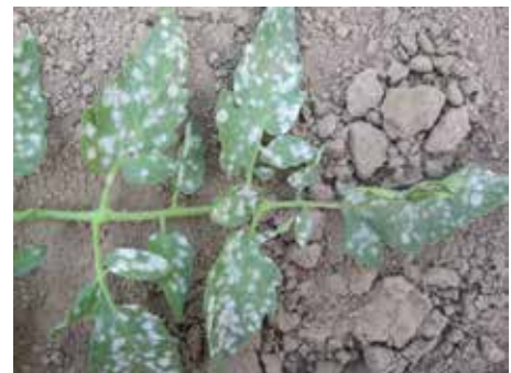
White sporulation of powdery mildew.