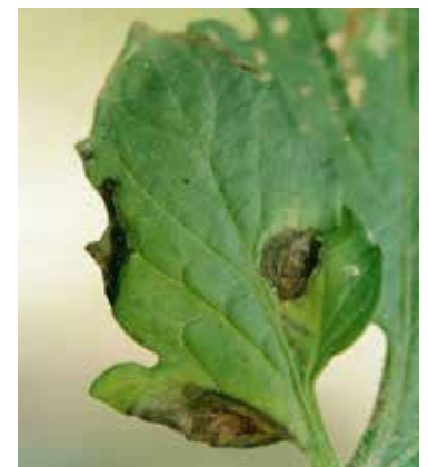
Lesions with concentric rings, characteristic of early blight.

Early blight ( Alternaria solani ) occurs on the foliage, stem, and fruit of tomato as well as potato. In tomato, the disease first appears as small brown to black lesions with yellow haloes on older foliage. Under conducive conditions, numerous lesions may occur on each leaf causing entire leaves to turn yellow. As the lesions enlarge, they often develop concentric rings giving them a ‘bull’s eye’ or ‘target-spot’ appearance. As the disease progresses, plants can become defoliated, reducing both fruit quantity and quality. Fruit can become infected either in the green or ripe stage. Infections usually occur through the stem attachment. Fruit lesions appear leathery and may have the same characteristic concentric rings as the foliage. Fruit lesions can become quite large, encompassing the whole fruit.