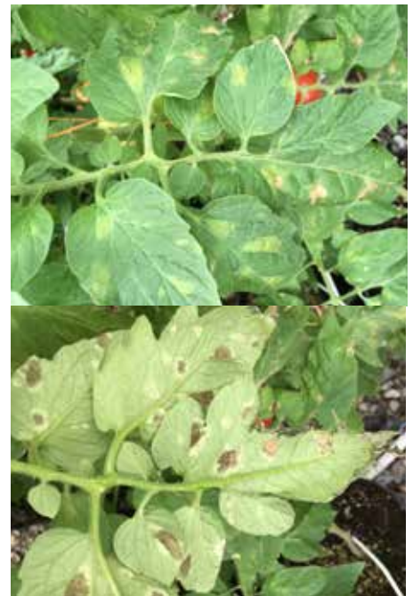
Upper and lower leaf symptoms of Fulvia leaf mold.

Leaf Mold ( Passalora fulva , previously Fulvia fulva ): This disease can occur in the field, but is most common in greenhouses, in both soilless and hydroponic systems. Leaf mold infections begin on older leaves and cause pale-green to yellow spots visible on the upper leaf surface, with olive-green to grayish-brown fuzzy sporulation on the underside of the leaf. Heavily infected leaves turn yellow, then brown, and may wither and drop. Occasionally petioles, stems, and fruit may be affected. Infected flowers wither without setting fruit and infected fruit has leathery, black, irregularly shaped lesions. The fungus overwinters in soil on crop residue and as sclerotia (hard, black, long-lived resting structures) and may be introduced on infested seed. Disease development is favored by warm, moist conditions with relative humidity over 85%. The fungus can survive and reproduce between 50-95°F, with optimal infection and growth between 71-75°F. The disease can spread rapidly as spores disperse throughout a greenhouse on air currents, water, rainsplash, insects, and workers.