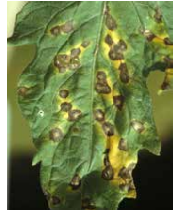
Septoria leaf spot.

Symptoms consist of circular, tan to grey lesions with dark brown margins that appear on lower leaves first, after the first fruit set. If conditions are favorable, lesions can enlarge rapidly, turning infected leaves yellow, then brown. S. lycopersici forms pycnidia (structures that produce asexual spores) in the center of expanding lesions, which can be seen with a 10X hand lens as tiny black dots. The presence of pycnidia, plus the generally smaller size of the lesions and the absence of target-like circular bands within the lesion, distinguish this disease from early blight.