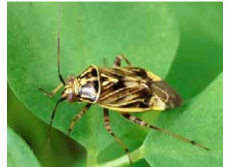
Tarnished plant bug adult.

Tarnished plant bugs have been seen in a variety of crops this year including potato and basil. They are an important pest of strawberry and often cause damage to ribs of Romaine lettuce, but have a very wide host range, including vegetable crops like asparagus, celery, and broccoli, and are especially attracted to buds and flowers. TPB have piercing-sucking mouthparts and while feeding, the bugs secrete a toxic substance from their salivary glands that kills cells surrounding the feeding site. Usually the first signs of damage are small brown spots on young leaves. As the tissue grows, healthy tissue expands while dead tissue does not, which results in holes and distorted, malformed leaves, buds, or fruit. Terminal shoots and flowers may be killed. TPB usually do not warrant chemical control in vegetable crops, but if damage is unacceptably high, use insecticide applications. Labeled products for TPB on lettuce are listed in the lettuce section of the New England Vegetable Management Guide and include several synthetic pyrethroids and carbamates. Pyganic may be used by organic growers. Avoid applications during bloom periods. Insecticide labels often list “lygus bug” instead of specifically “tarnished plant bug”.