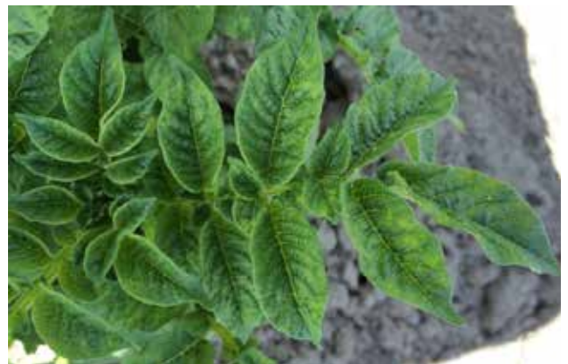
Virus symptoms in Gold Rush potato - mottled chlorosis, or small or puckered leaves.

Potato virus Y was confirmed in 'Red Norland' potatoes from Franklin Co., MA. This virus is introduced on contaminated seed and is then spread in the field by aphids. Rogue out virusy-looking plants (see photo) and control aphids. Since aphids spread PVY non-persistently, meaning that the virus does not persist within the aphids for a long time, insecticides are often ineffective and are not considered a valuable control strategy. However, repellents such as horticultural oils (especially early on when aphid populations are low and plants are young) and newer behavior modifying pesticides may be of use, including: Assail, Belay, Admire Pro, Fulfill, Moven, and Platinum.