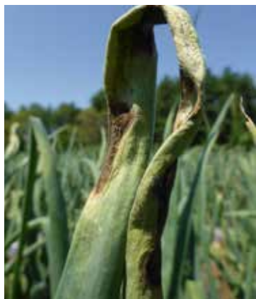
Dark brown lesions with fluffy gray sporulation, characteristic of allium downy mildew.

Root maggot flies are active again, laying eggs which will hatch quickly in warm weather. This means that larvae will soon start feeding again on plant roots causing collapse of seedlings and tunneling on root crops like salad turnips. Cool, moist soil conditions favor survival of the eggs, and soil temperatures that exceed 95°F in the top 2-3 inches will kill them, so eggs may be killed with next week’s higher temperatures. Cultivating around the base of plants can disturb the soil, helping to expose eggs to heat and desiccation, and moderate hilling can help plants put out new roots to compensate for losses from root maggot damage.