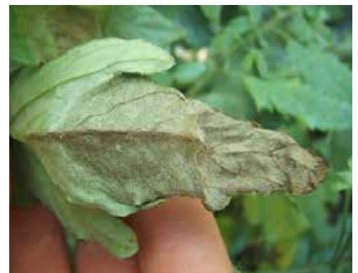
Late blight lesion on tomato foliage.