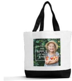
Tote with Club Name

More information is on the website along with ideas for community service: