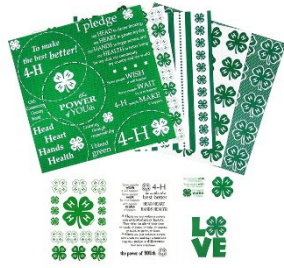
Scrapbook Kit & Cards