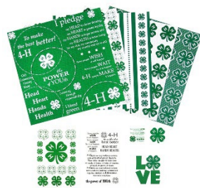
Scrapbook Kit & Cards