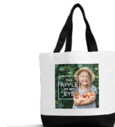
Tote with Club Name

More information is on the website along with ideas for community service: https://ag.umass.edu/mass4h/clubs-programs/community-service