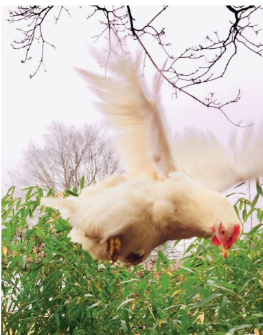
Olive G Age 11 Western Mass Region Fly Chicken Fly!

The UMass 4-H State 4-H Photography contest encourages self-expression and creativity. The 4-H members who participate demonstrate many skills, including the use of photographic equipment, photo composition, photography resolution, and creativity. Over the next few weeks, we will feature the twelve Big E Quality Photos selected by the judges of this competition. These photos are on display in the New England Center at the Eastern States Exposition (The Big E) throughout the 17 days of the fair. If you are visiting, stop in to see the photos in person.