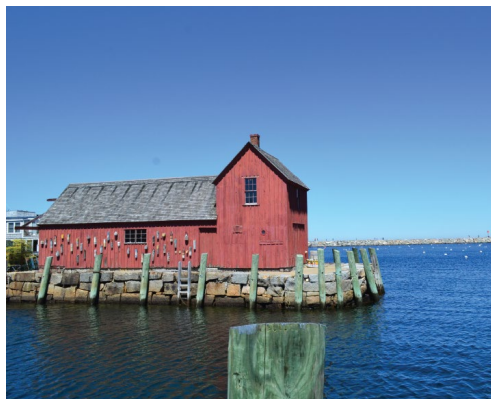
Rylie B Age 8 Northeast Region A Day at Rockport

The UMass 4-H State 4-H Photography contest encourages self-expression and creativity. The 4-H members who participate demonstrate many skills, including the use of photographic equipment, photo composition, photography resolution, and creativity. Over the next few weeks, we will feature the twelve Big E Quality Photos selected by the judges of this competition. These photos are on display in the New England Center at the Eastern States Exposition (The Big E) throughout the 17 days of the fair. If you are visiting, stop in to see the photos in person.