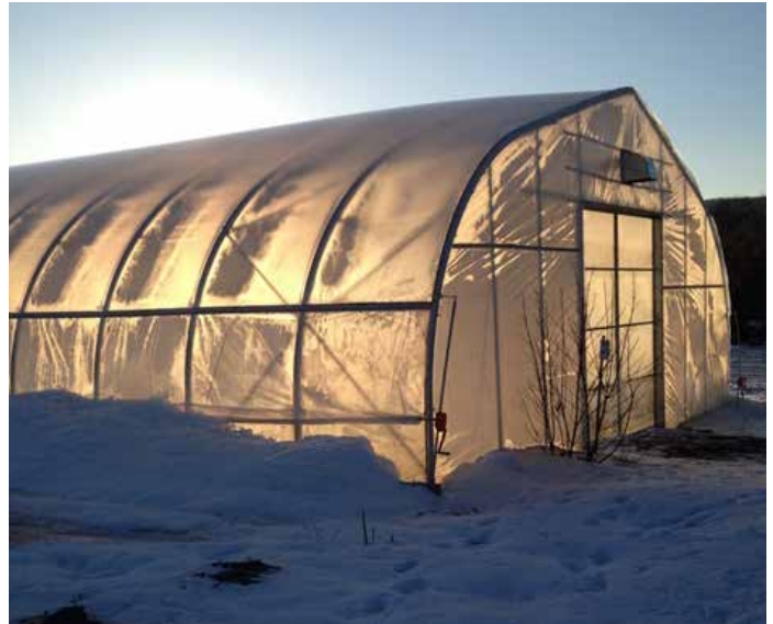
Now is the time to get your greenhouse cleaned up and ready to grow healthy transplants this spring!

I've heard growers ask if allowing the greenhouse to 'freeze' for several days in cold weather means that insect pests will be killed; and the answer is no. Heat can be more effective than freezing for pest destruction. For example, heat has been shown to be more effective for the control of thrips, according to Leanne Pundt of the University of Connecticut. In one study, high temperature (104°F) combined with very low humidity (less than 10%) for three to four days killed most adult