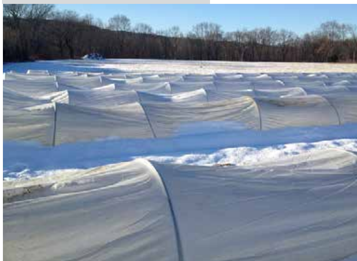
Buried under snow and ice, crops wait to get growing again in low tunnels at Red Fire Farm in Montague, MA.

The New England Vegetable and Fruit Conference was a great success with positive feedback on the information gained, old friends seen, new connections made, and the general tone of vibrant energy. This conference broke all past attendance records but meeting rooms were rarely too full – maybe because the trade show was such a busy place! From aspiring to retiring farmers and everything in between, our industry was well represented. The conference website ( http://newenglandvfc.org/ ) will be posting powerpoints as well as proceedings.