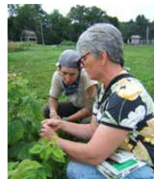
Vegetable and fruit extension teams work together to assist growers in the field.

This information will assist us as we seek to fund new projects and continue our current pro-