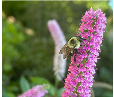
Bombus griseocollis , the brown-belted bumble bee.

Massachusetts is home to 396 recorded bee species, covering 43 genera and six of the seven bee families. These bees come in all different colors, shapes, and sizes. Bees also display a variety of distinguishing traits: for example, their social behaviors, nesting habits, and diet breadth. Let's get to know the bees of Massachusetts by examining their traits!