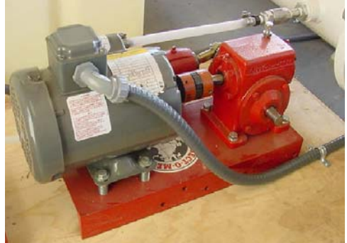
Fig. 2. (Top) Irrigation line check valve, vacuum relief valve, and low pressure drain. (Bottom) Pesticide metering pump. Diagram and photos courtesy <u>http://www.cdpr.ca.gov/docs/emon/grndwtr/chem/chemdevices.htm</u>.