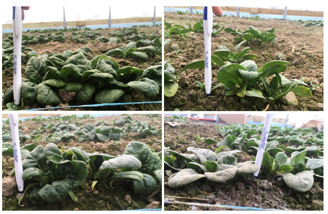
Photos taken February 5, three months after seeding. Clockwise from top left: Kiowa, Nevada, Tasman, and Regor.

Several winter spinach growers told us that the demand for local spinach in the winter is so high that they can sell as much as they can produce, regardless of leaf shape, minor flavor or texture differences,