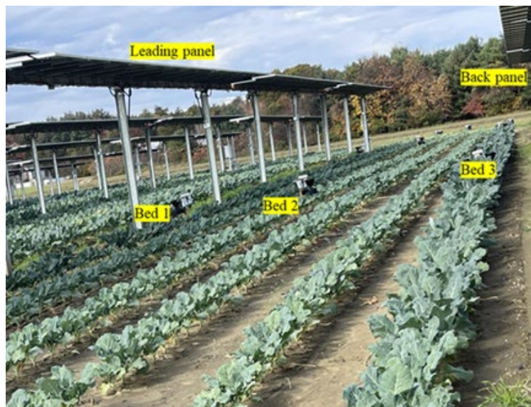
Figure 1. Broccoli planted in three different bed positions under the solar array.

Broccoli was transplanted on August 18, 2023, with a spacing of 30 cm between plants and 90 cm between rows. Microclimate sensor stands were placed only in three beds: 1) leading panels, 2) between two panels, and 3) near the back panel in three replications as depicted in Figure 1. Microclimate sensors were installed on August 22, and in control sites on August 22 and September 3, 2023. The sensors were mounted in the stand as in Figure 2 at a height of 20 inches above the soil. All sensors were removed from the field on Dec 6, 2023, and stored for the next season.