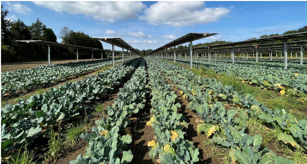
Joe Czajkowski Farm, Hyperion Systems

The current results gave us a snapshot of how the presence of solar panels modifies the microclimate variables at the crop canopy level while averaging data from the whole crop season. However, to explore more about the effects of solar panels on microclimate variables in detail, a time series analysis will be done. The comparative analysis between control and array on different timescales: daily, weekly, and monthly allows for a comprehensive understanding of the impacts of microclimate variables on broccoli growth and development. Lessons learned in 2023 will be applied during the 2024 season.