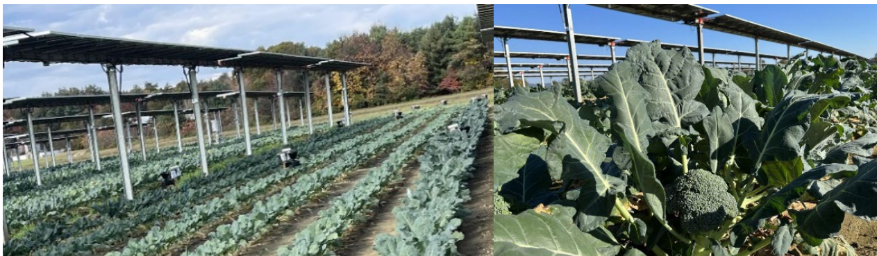
Joe Czajkowski Farm, Hyperion Systems

Agrivoltaics is the simultaneous production of both solar energy and crops on the same land. This entails trade-offs that are poorly understood and require optimization between two objectives for which there is little research-based guidance. The presence of solar panels above the crops can modify the microclimate variables such as light intensity, photoperiod, and temperatures. To study the dynamics of agrivoltaic systems on crop production, late-season broccoli was chosen for the experiment under an on-farm solar array in Hadley, MA in 2023. Broccoli is a staple vegetable with high nutrition and commercial values that is adapted to various environmental conditions. Changes in the sun's angle, panel height and orientation, tracking system, and spacing between panels create distinct microclimate environments for crops underneath panels. Therefore, we evaluated microclimate variables such as photosynthetically active radiation, relative humidity, air temperature, and soil temperature at different transect positions throughout the crop growing seasons along with crop growth and yield of late-season broccoli.