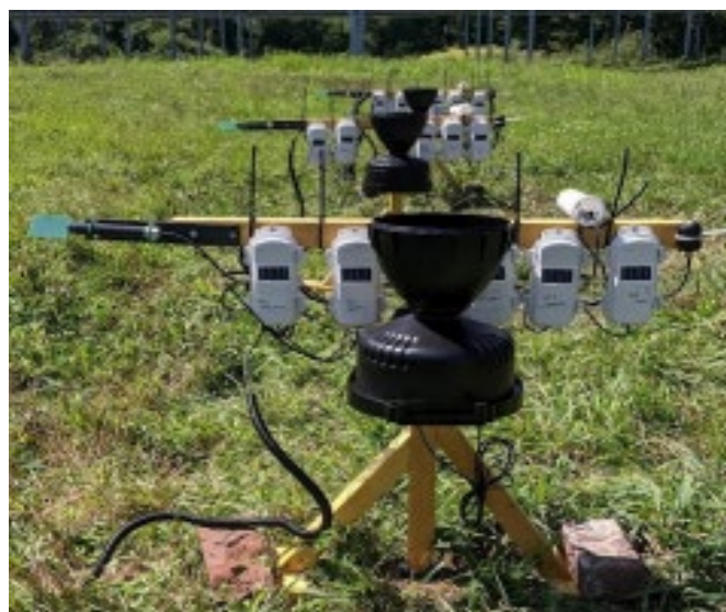
Figure 2. Mounting unit assembly with sensors.

An independent sample t-test was conducted to compare the control group with each bed position within the array. To compare the effects of bed positions within the array without control, one-way analysis of variance (ANOVA) was done. Mean separation for statistically significant effects was performed using Tukey's HSD test.