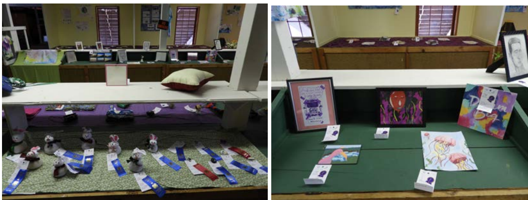
Exhibit Hall Classes will be divided as follows: (for age clarification see general rules)

Exhibits must remain until after the awards ceremony