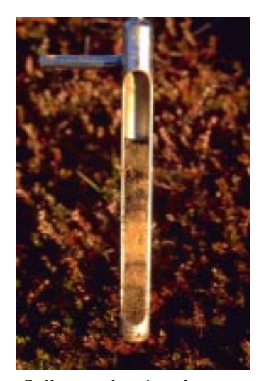
Soil core showing the 'alternating layers' of sand and organic matter typical of cranberry soils.

Cranberry bog soil is unique in that it consists of alternating layers of sand and organic matter. Dead leaves accumulate over the course of time and sand is added to the bed surface every 2-5 years to encourage upright production and maintain productivity. In contrast to normal agricultural soils, cranberry soil requires no tilling, remains undisturbed over time, and little mixing of sand and organic matter occurs.