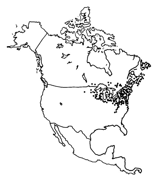
Native distribution of cranberry in North America.

Short vertical upright branches, known as uprights, form from the buds along the runners. The uprights have a vertical (non-trailing) growth habit and form the terminal buds that contain the flower buds. Most of the fruit is formed from the flowers on the uprights, with some berries arising from flowers on the runner ends.