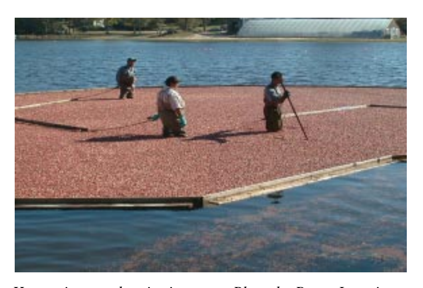
Harvesting cranberries in water.

During the first three weeks following fruit set, the fruit acquire most of their mineral components. From that point through harvest, fruit grow by the accumulation of carbohydrates (sugars and starch produced through photosynthesis) and water. Irrigation is often necessary during this period. By September, the fruit begin to develop their characteristic red color through the production of anthocyanin pigments. Full fruit maturity occurs approximately 80 days after full bloom. Cranberry harvest in Massachusetts extends from mid-September through October and is at its height in mid-October.