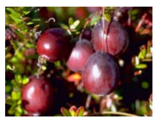
Mature 'Stevens' berries.

The plants thrive on the special combination of soils and hydrology found in wetlands. Natural Massachusetts bogs evolved from glacial deposits that left kettle holes lined with