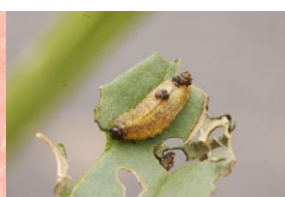
3-lined potato beetle, adult & larva