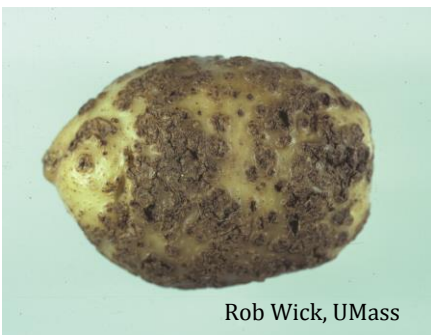
Rob Wick, UMass

Late Blight ( Phytophthora infestans ) affects potato foliage, stems, and tubers. The pathogen is a fungus-like oomycete that spreads easily via sporangia on wind and rain and is capable of destroying entire fields in a few days. Classic symptoms are large (at least nickel-sized) olive-green to brown spots on leaves with slightly fuzzy white fungal growth on the underside when conditions have been humid (early morning or after rain). Sometimes the lesion border is yellow or has a water-soaked appearance. Brown to blackish lesions also develop on upper stems. P. infestans requires a living host to survive, which can include potato tubers. New infections may occur when cool, wet weather conditions favor the disease and when infected inoculum is present. Sources of new infections may be infected tubers that survived the winter in storage or cull piles, volunteers from infected tubers in the ground, or sporangia that are driven northward from the southern areas where the pathogen can overwinter. Using disease-resistant cultivars and taking steps to prevent infections are key to managing this disease.