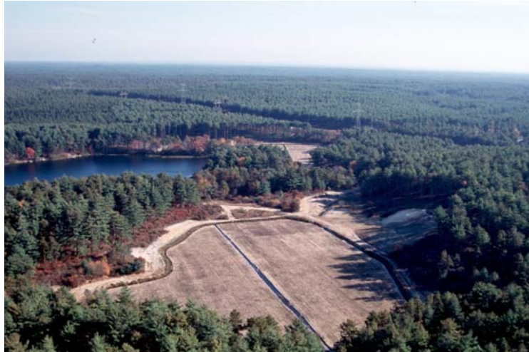
Figure 1. Aerial view of a commercial cranberry farm in Southeastern Massachusetts showing interior and exterior ditches, perimeter roads, and proximity to nearby water resources.

uprights that are biennial bearing [Eaton 1978]. Optimally, the vine cover is continuous across the production area yielding vine densities of 4,300-6,500 uprights per m 2 [DeMoranville 2007]. The farm area is typically the lowest part of the landscape and is comprised of perimeter and interior drainage ditches and dikes that can readily contain water (Fig. 1). Due to the periodic need of flooding, farms are always associated with nearby water bodies such as ponds, rivers, or man-made reservoirs. Irrigation systems consisting of flood gates, flumes, lift pumps, piping, and sprinkler heads are critical components of the working farm.