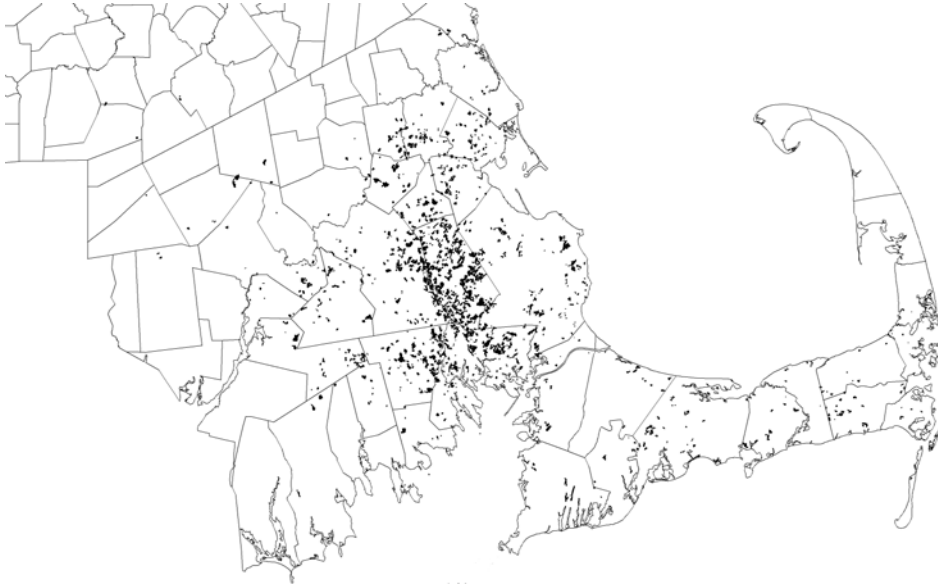
Figure 3. Distribution of cranberry farms in the towns of southeastern Massachusetts ca. 2000. Each mark represents one farm, regardless of size.

According to the most recent census, Plymouth has the largest land area of the five towns (250 km 2 ) and the second highest population density (207 persons per km 2 ) [Plymouth County 2007]. Middleboro is the next largest town of the group with a land area of 176 km 2 and a population density of 113 persons per km 2 . The towns of Carver, Wareham, and Rochester are approximately the same size in land area (93 km 2 ) but vary in population density. Wareham has the highest density of the five towns with 219 people per km 2 ; Carver is half as densely populated at 113 people per km 2 and Rochester is half again less dense at 49 people per km 2 [UMass Donahue Institute 2005].