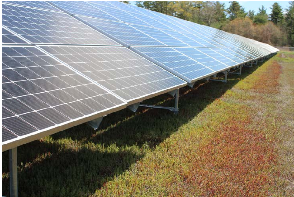
Figure 1. Cranberry vines growing under solar PV system in Carver, MA.

What is light saturation and why is it important? As light increases, the rate of photosynthesis also increases, but only up to a point. At the light saturation point, having access to more light no longer causes an increase in photosynthesis. In fact, at high levels of solar radiation, oversaturation of the leaf photosynthetic apparatus may result in a decrease in photosynthetic light use efficiency in a process referred to as photoinhibition. The lower the light saturation point in cranberry may increase the likelihood that the vines will do well in shaded conditions due to reduced photoinhibition.