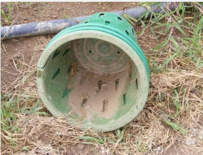
What NOT to do: harvest baskets lying in mud.