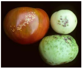
Upper left-Canker, Upper Right-Spot, Lower-Speck.

Tomato Pith Necrosis is caused by Pseudomonas corrugata and other soil-borne species of Pseudomonas . While high tunnels and greenhouses provide ideal conditions for the growth of early season tomatoes, this environment also provides ideal conditions for this emerging disease. Pith necrosis generally occurs on early planted tomatoes growing when night temperatures are cool, the humidity is high, and the plants are growing vigorously because of excessive levels of nitrogen. The disease is also associated with prolonged periods of cloudy, cool weather. Initial symptoms often appear just as the first fruit clusters reach the mature, green stage, and consist of yellowing and wilting of young leaves. Serious infections can result in yellowing and wilting of upper portions of plants, with brown to black lesions on infected stems and petioles. When stems are cut longitudinally, the center of the stem (pith) may be extensively discolored, hollow, and/or degraded. Stems may be swollen, numerous adventitious roots can form, and infected stems may shrink, crack, or collapse. The epidemiology of this disease is not well understood; it is possible that the bacteria are seed-borne and most certainly survive in the soil in association with infected tomato debris.