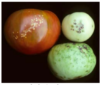
Upper left-Canker, Upper Right-Spot, Lower-Speck.

Tomato Pith Necrosis is caused by Pseudomonas corrugata and other soil-borne species of Pseudomonas . While high tunnels and greenhouses provide ideal conditions for the growth of early season tomatoes, this environment also provides ideal conditions for this emerging disease. Pith necrosis generally occurs on early planted tomatoes growing when night temperatures are cool, the humidity is high, and the plants are growing vigorously because of excessive levels of nitrogen. The disease is also associated with prolonged periods of cloudy, cool weather. Initial symptoms often appear just as the first fruit clusters reach the mature, green stage, and consist of yellowing and wilting of young leaves. Serious infections can result in yellowing and wilting of upper portions of plants, with brown to black lesions on infected stems and petioles. When stems are cut longitudinally, the center of the stem (pith) may be extensively discolored, hollow, and/or degraded. Stems may be swollen, numerous adventitious roots can form, and infected stems may shrink, crack, or collapse. The epidemiology of this disease is not well understood; it is possible that the bacteria are seed-borne and most certainly survive in the soil in association with infected tomato debris.