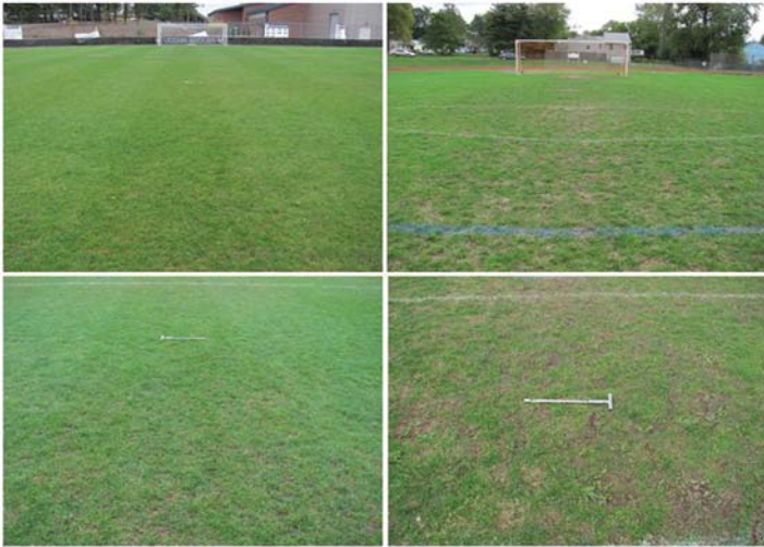
>> Figure 1. PANELS TO THE LEFT show high maintenance soccer field while the panels to the right show low soccer maintenance field receiving the same level of use of 146 hours for the season.

Surface smoothness and overall field quality also improved as the bulk density increased ( r = 0.81 and r = 0.58 , respectively), largely a result of a firmer surface due to greater sand content. We previously had found a highly significant correlation between surface hardness and bulk density.