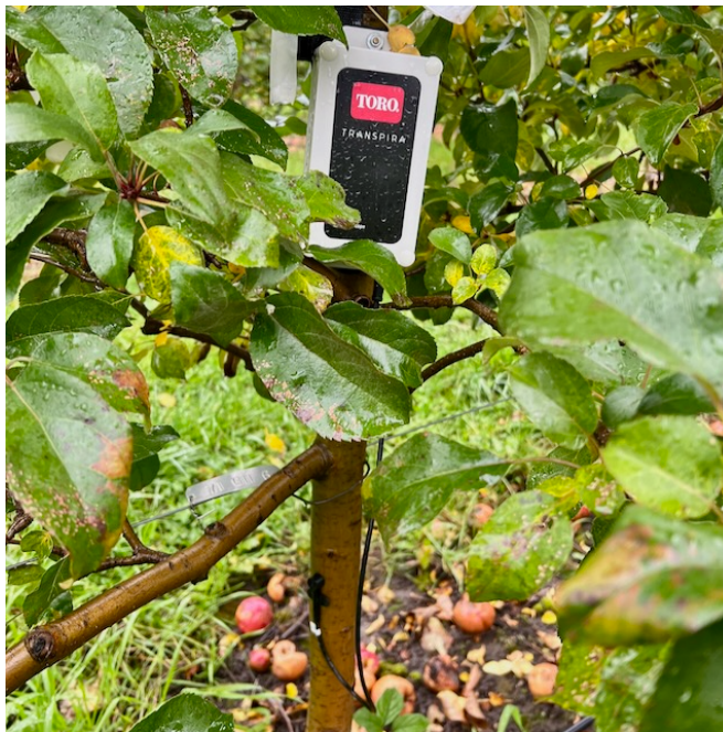
Figure 4 – Treetoscope/TRANSPIRA online dashboard to monitor tree/block actual water consumption and irrigation requirement