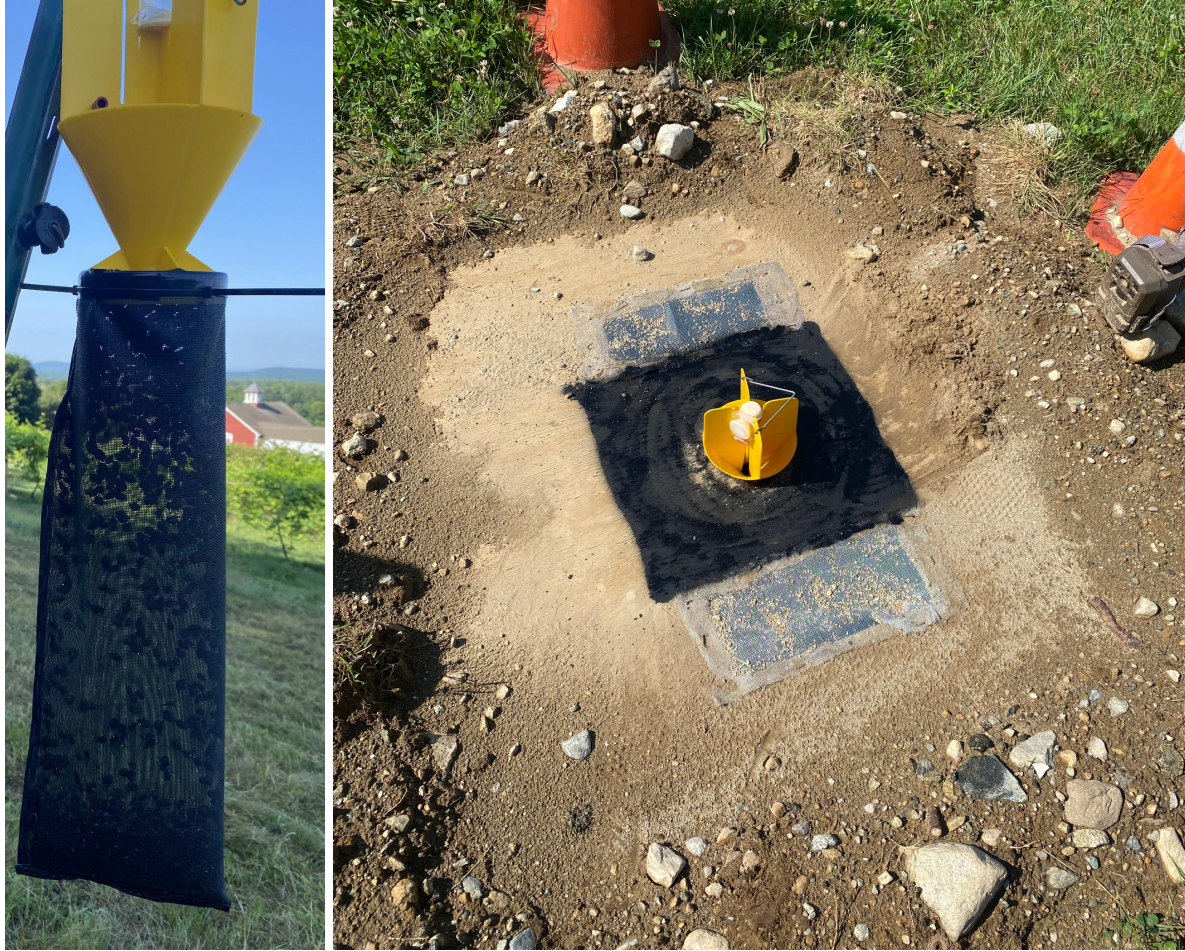
Figure 1. Above left , sock trap design used in MO. Above right , failed in-ground trap for automatic JB composting.

We followed the protocol established by Piñero & Dudenhoeffer (2018) to manufacture mass trapping socks. Briefly, we used rectangular 0.75 meter x 0.5-meter cuts of a plastic mesh material, which was folded and stapled onto itself on the side and bottom to create a cylindrical shape. Then this mesh cylinder, or “sock”, was securely taped to a plastic trap acquired from Trécé (Trécé Inc., Adair, OK, USA), which consists of a one-piece molded vane of yellow panels that intersect at 90° with a funnel underneath ending in a wide rim. Beetles hitting the vane fall through the funnel into the collecting device (sock).