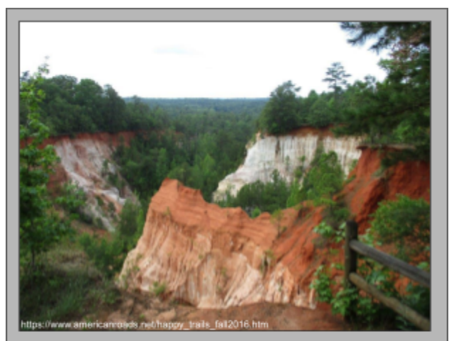
The white material in the canyon walls at Providence Canyon State Park in Georgia, USA is kaolin clay.

feldspar, and anatase are some examples. Crude kaolin is sometimes stained yellow due to iron hydroxide pigments, so it is bleached to remove the pigments, and washed with water to remove the other minerals present.