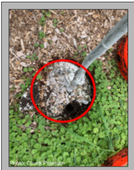
The red circle shows kaolin clay applied as a ground cover for weed control experimentally to determine kaolin's impact on soil health.

Kaolin clay is employed in fruit production as a pesticide and disease management agent, while also offering some protection against heat stress. It is sprayed as a powdered suspension, coating the leaves and fruit with white dusty film, which adheres to insects and acts as an irritant, greatly reducing their capacity to cause damage to the